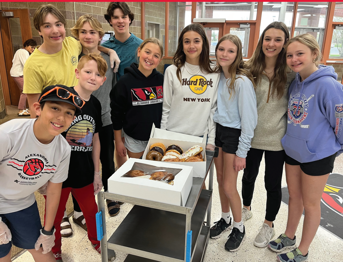
Discovery Middle School (DMS) unites students transitioning from elementary level grades into our grade 6-8 Alexandria Cardinal middle school community.

Boys Basketball 3/13-16 @ State Tourney.....TBD