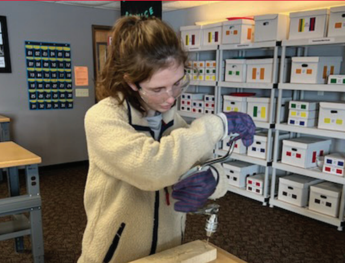
Transition Center serves students ages 18-22 to help them develop skills to become more independent in their community in the areas of: Healthy Independent Living • Community Participation • Employment.

Boys Tennis 6/4-7 @ State Tourney..... TBD