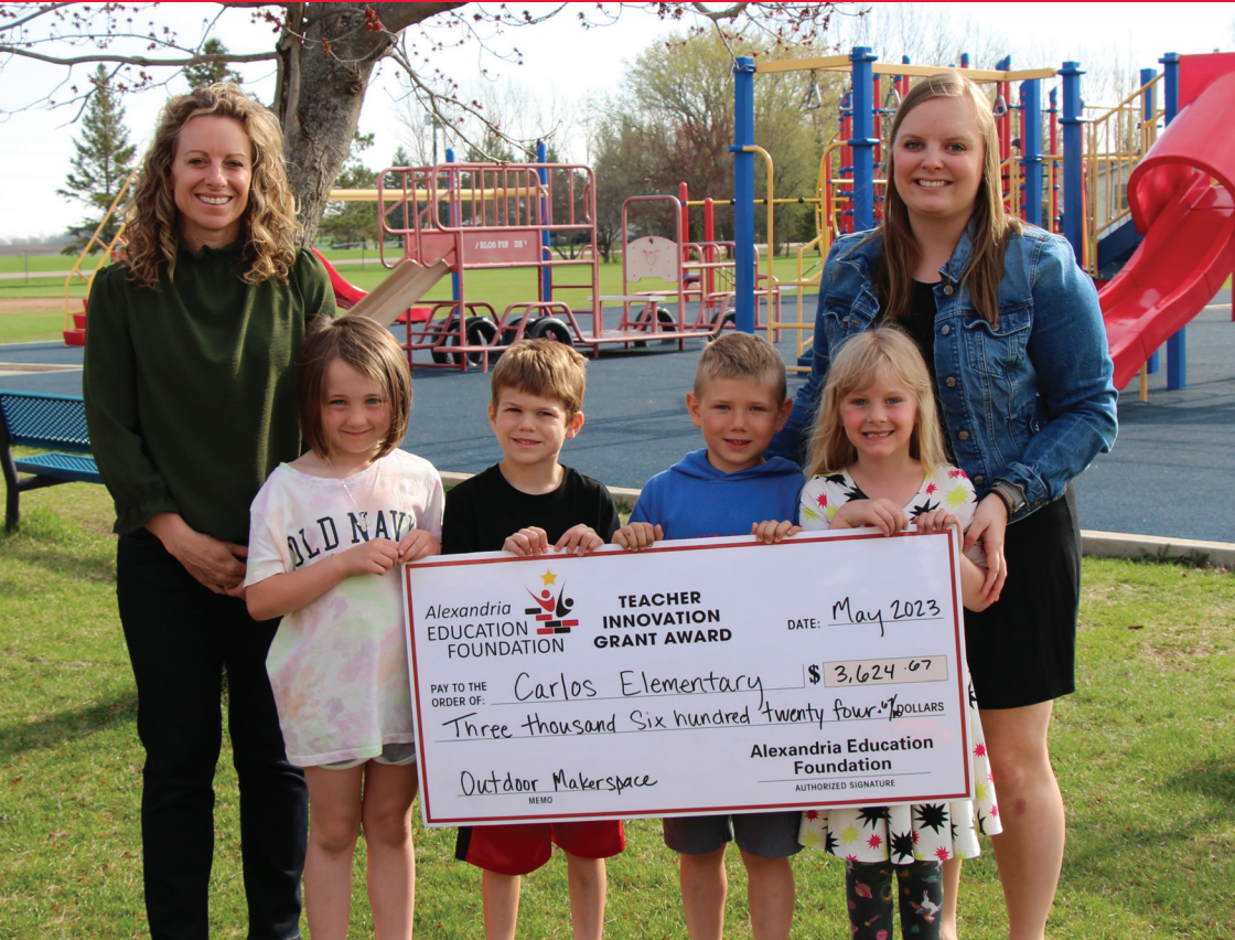
Carlos Elementary School is a little school with a lot of heart! The staff is committed to providing a quality education for each student and is heavily supported by a very generous community.

Girls Soccer 8/24 Sauk Rapids-Rice ..... 7:00pm 8/26 @ Detroit Lakes..... 1:00pm 8/29 @ Willmar ..... 7:00pm 8/31 Cloquet..... 3:00pm