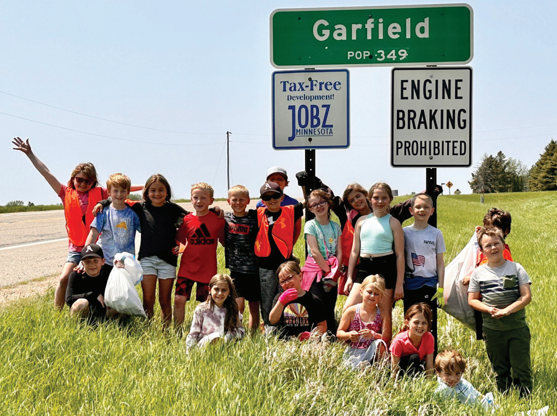
Garfield Elementary staff members nurture students in an open, friendly atmosphere. The family atmosphere permeates the school and is supported by involved parents.